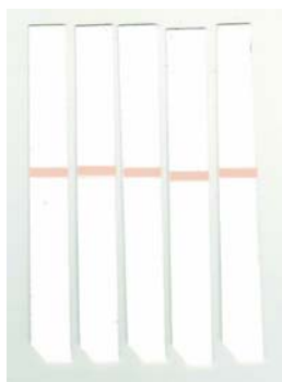
Figure 1. The specificity of the MAbs were analyzed by Western blot using OMV from B:4:P1.(7).4 strains. Lanes 1-4 corresponding to MAbs anti Por A obtained (CU-NmPorA4(54), CU-NmPorA4(80), CU-NmPorA4(324), CU-NmPorA4(447) and line 5 corresponding to referent MAb (MN20B9.34).

The specificity of the obtained MAbs anti PorA were studied by Immunoblot analysis using a strain of N. meningitidis separated by SDS-PAGE. Figure 1 (lane 1-4) shows that all MAbs recognized a 46-kDa antigen, corresponding to PorA protein from N. meningitidis serogroup B strain B:4:P1.(7b).4. This finding was corroborated by using reference MAbs anti PorA protein against subtype P1.4. The four MAbs obtained were coded as follow: CU-NmPorA4 (54); CU-NmPorA4(80); CU-NmPorA4(324) and CU-NmPorA4(447). The isotype of all MAbs were IgG1.