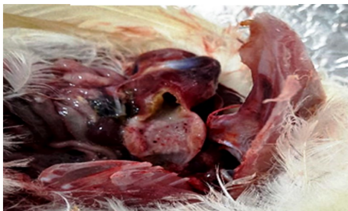
Fig. 1. Post challenge lesion, post mortem inspection, showing pin pointed hemorrhages at the proventriculus.